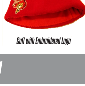
Cuff with Embroidered Logo

Download the complete catalog at the bottom of this page.