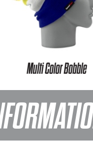
Multi Color Bobble