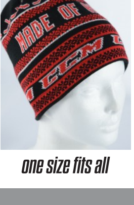
one size fits all

(After Order Approval Process Completed) See below for more details